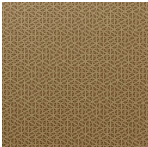
Image depicts 12 x 12 inch section